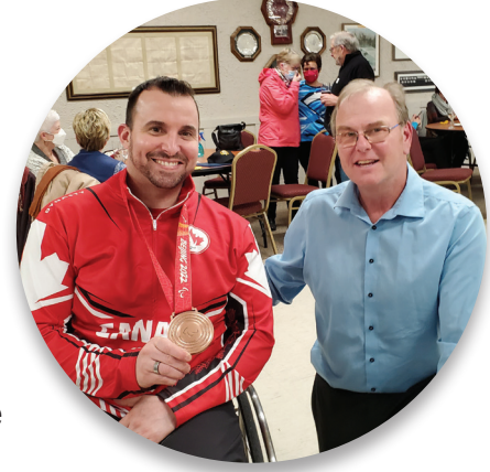
Paralympic Bronze Medal Champior